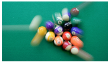
Retrieve BodyPart names from Collision Event