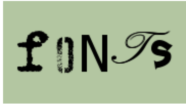
Text Objects String